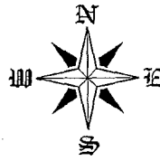
Exhibit B Resolution 579-09 Lansdowne Oaks, Block B